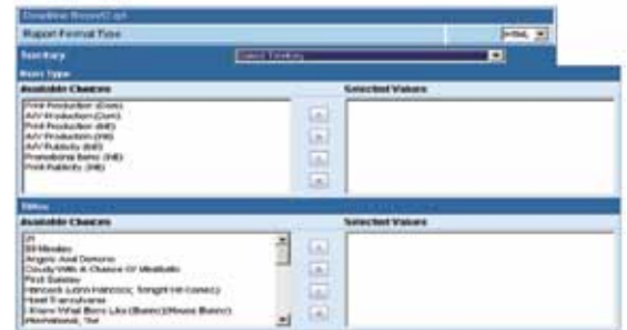
Screen shot of multi select report design